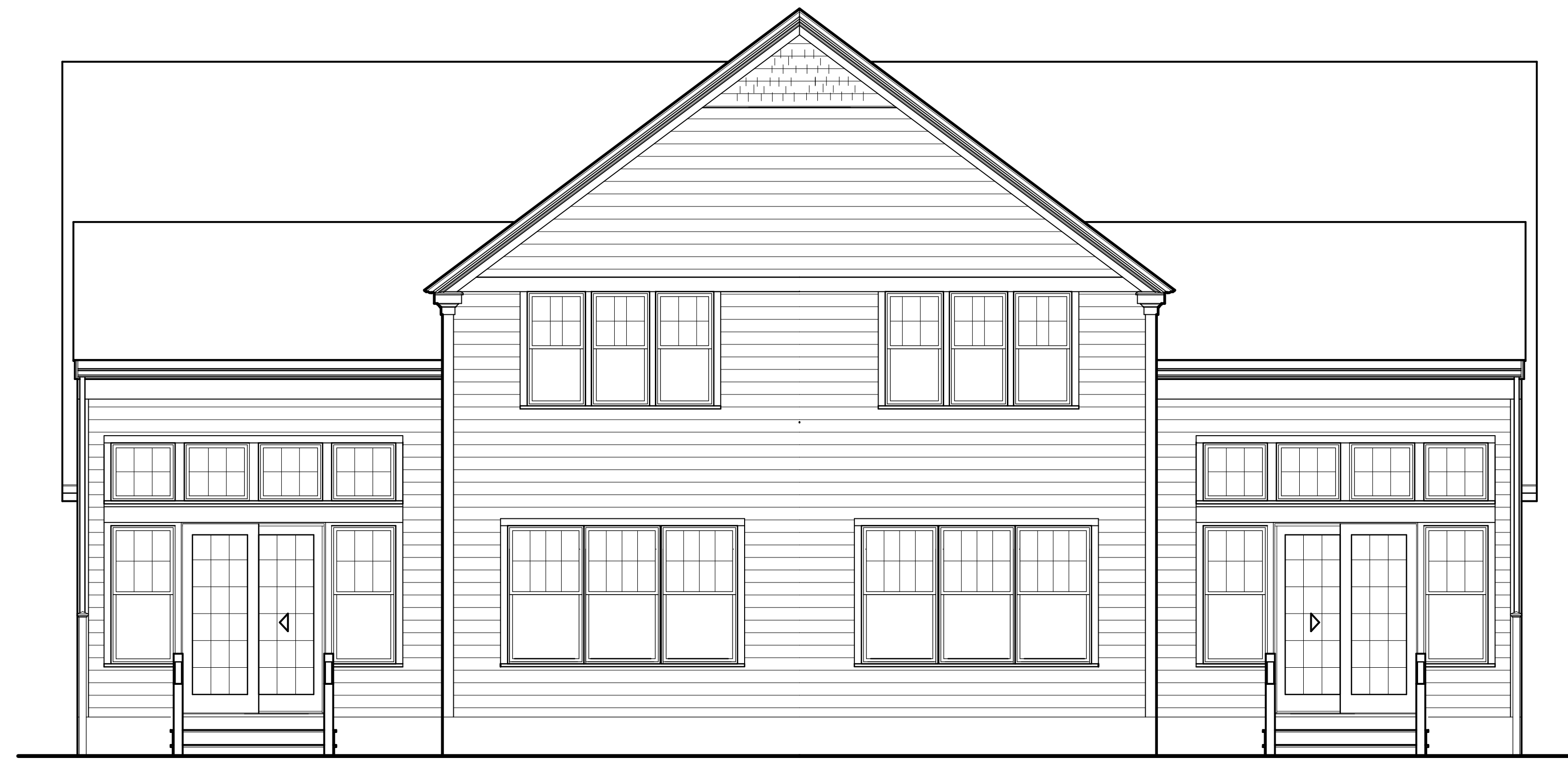
REAR ELEVATION-BUILDING TYPE D SINGLE - UNIT TYPE 302 SCALE: 1/4" = 1'-0"