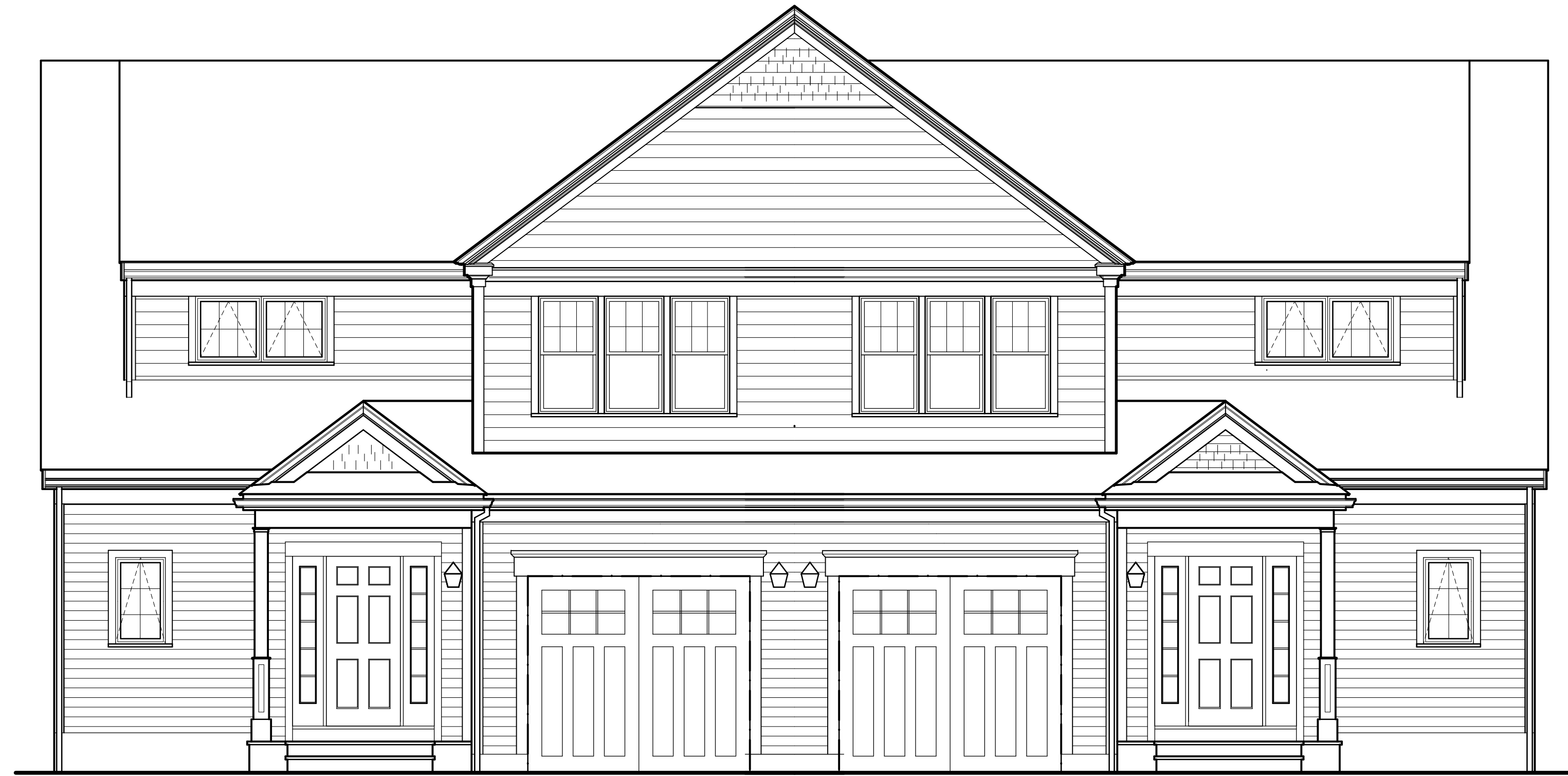
FRONT ELEVATION - BUILDING TYPE D SINGLE - UNIT TYPE 302 SCALE: 1/4" = 1'-0"