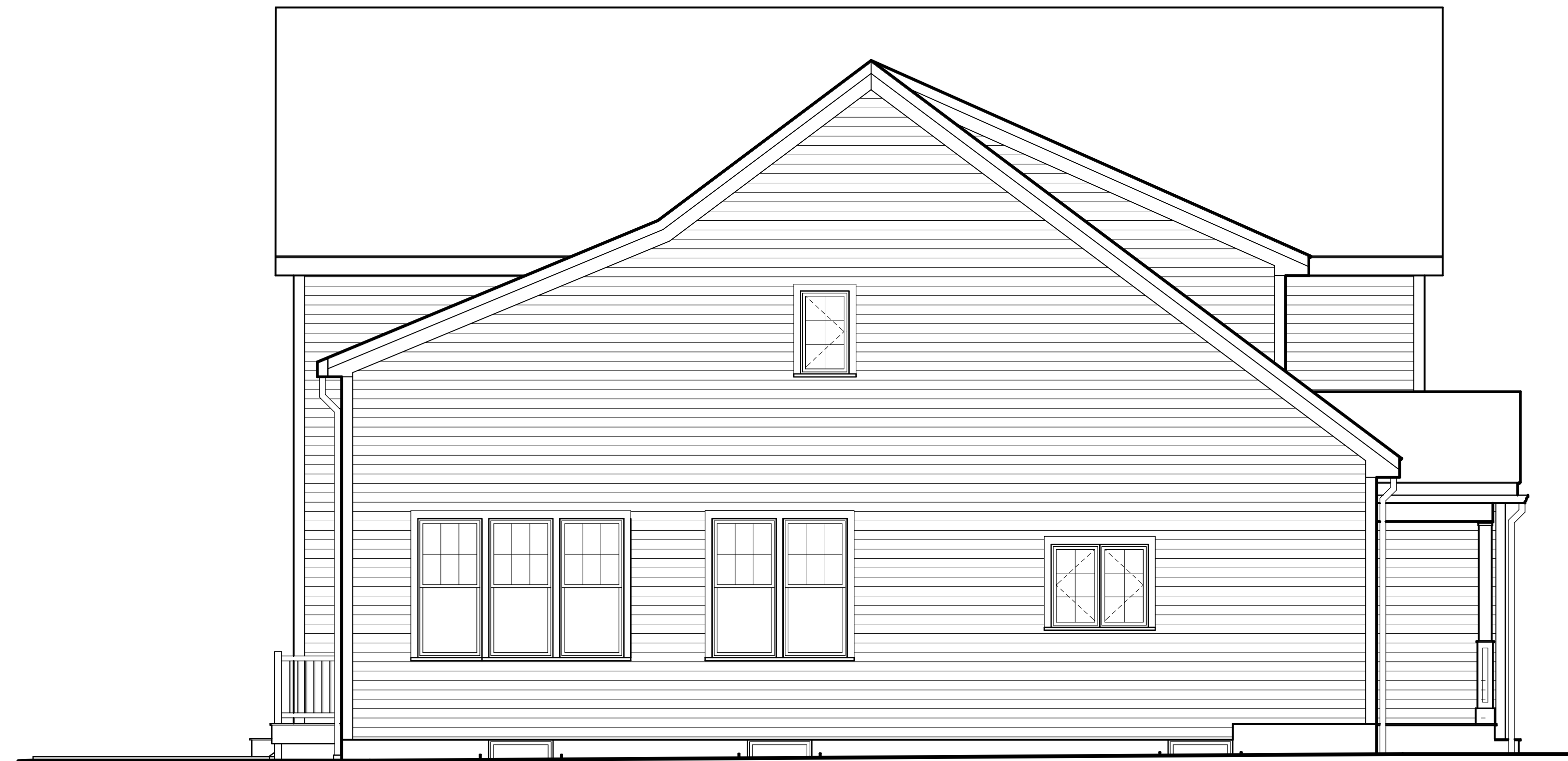
SIDE ELEVATION - BUILDING TYPE D SINGLE - UNIT TYPE 302 SCALE: 1/4" = 1'-0"