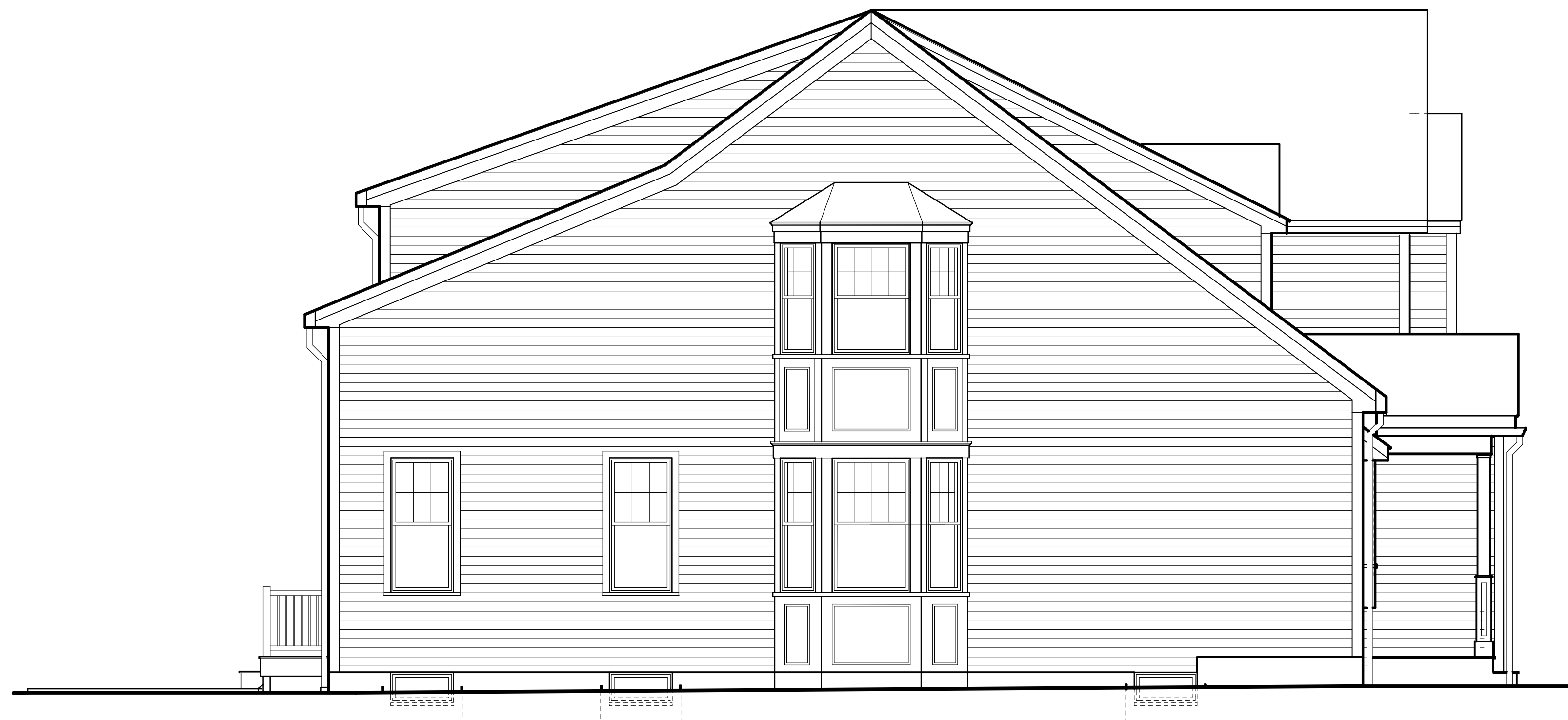
SIDE ELEVATION - BUILDING TYPE B SINGLE - UNIT TYPE 403 SCALE: 1/4" = 1'-0"