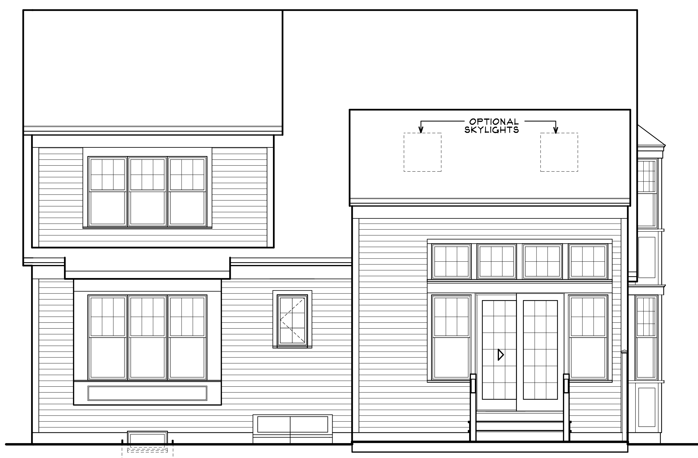
REAR ELEVATION - BUILDING TYPE B SINGLE - UNIT TYPE 403 SCALE: 1/4" = 1'-0"