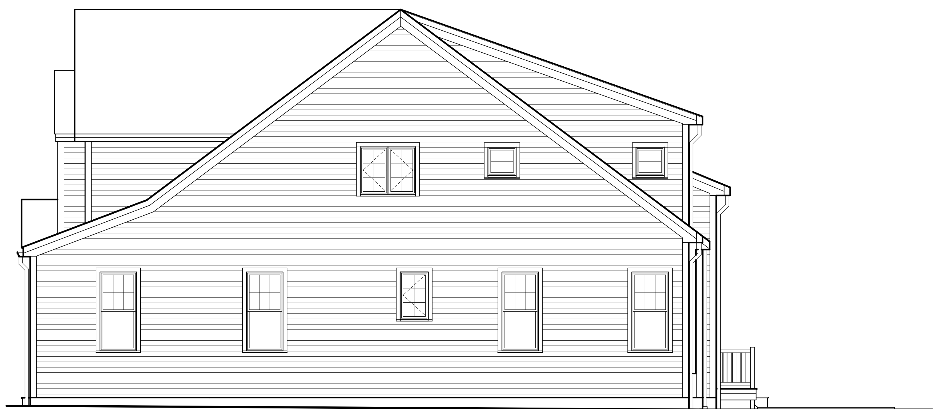
SIDE ELEVATION - BUILDING TPE B SINGLE - UNIT TYPE 403 SCALE: 1/4" = 1'-0"