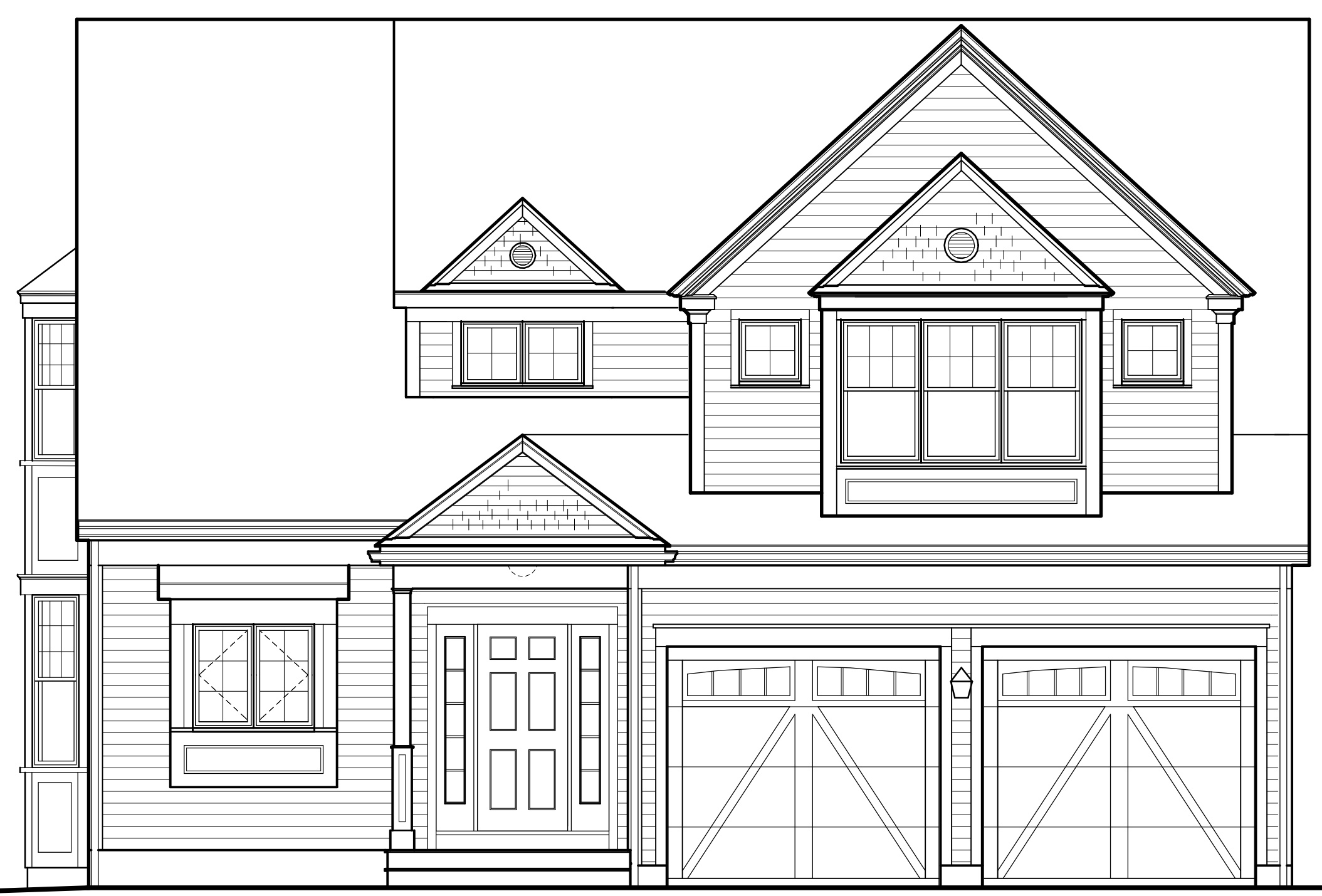
FRONT ELEVATION - BUILDING TYPE B SINGLE - UNIT TYPE 403 SCALE: 1/4" = 1'-0"